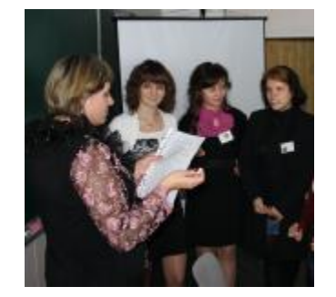
Auditorium 343. Station 'Quiz'